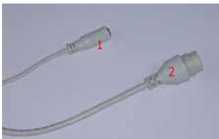
1-Power Supply 2-network interface